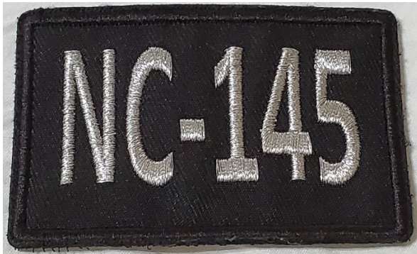
Velcro Embroidered Patch