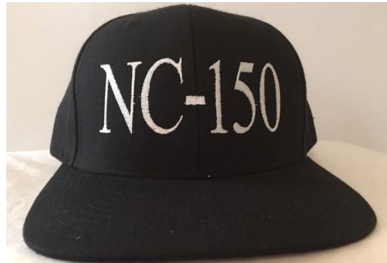
Embroidered Unit Designation